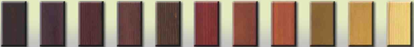
Lasur colours of pine windows and exterior doors