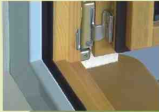
or wood-aluminium windows...