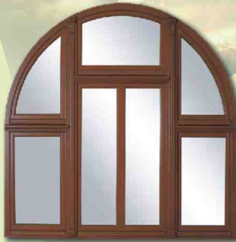
Antique Style Windows