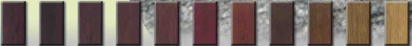
Lasur colours of mahogany windows and exterior doors