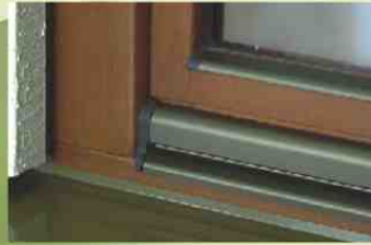
but always top quality,