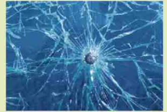
comfort and security...