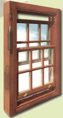
Sliding Sash Windows